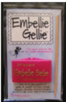
Package Size: 3" x 5" Package Wt: .5 oz MSRP: $5.99