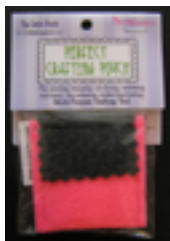
Product Size: 3" x 3.5" Package Wt: 1.5 oz MSRP $11.99